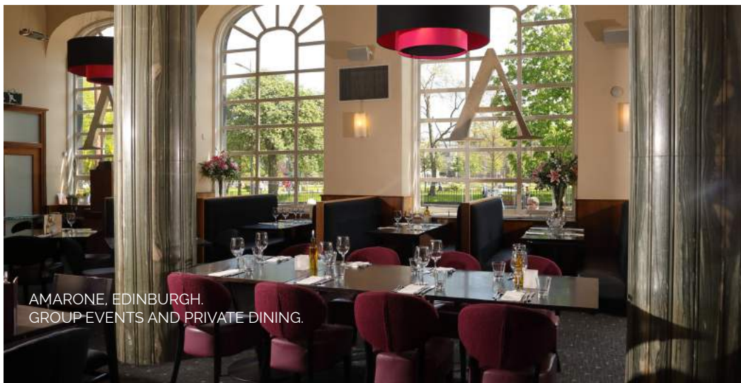
AMARONE, EDINBURGH. GROUP EVENTS AND PRIVATE DINING.

We have private dining rooms for groups as small as ten to gatherings up to 150 for private dining. Step into an Andalusian grand dining room or into "strong room" vaults for the ultimate privacy. Dining and your own traditional bar? We can offer that too. Our full collection can be found at www.thedrg.co.uk/inspiring-spaces