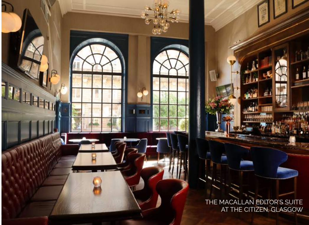
THE MACALLAN EDITOR'S SUITE AT THE CITIZEN, GLASGOW